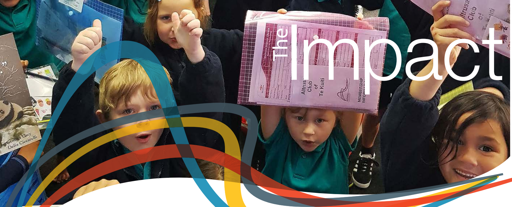
Photo above: Five-year-old students receive a book, pencil, eraser, stickers, Altrusa bookmarks, and an invitation to join the local library. Rocket Into Reading project grant, Altrusa Club of Te Kuiti, New Zealand, District Fifteen