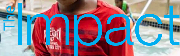
Photo above: Campers take a break while working on their physical goals at Camp Dreamcatcher in Kennett Square, Pennsylvania.