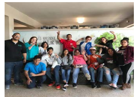
Altrusa supports EDP University students with clothes, food vouchers, and educational workshops.

Please send nominations for Spotlight an Altrusan , or Altrusa Club , to foundation@altrusa.org