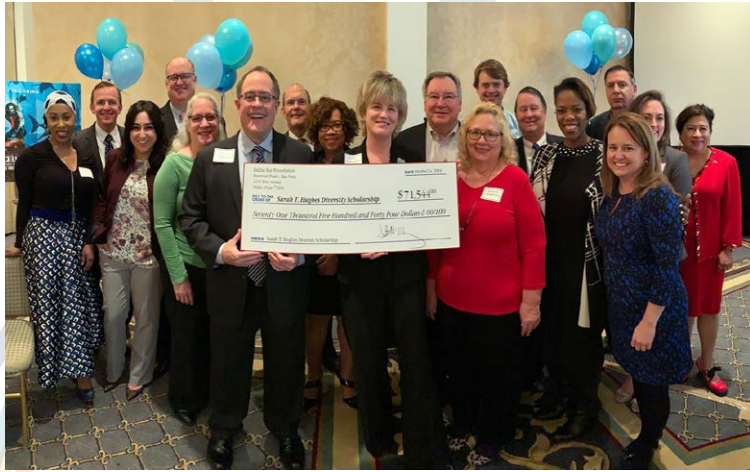
The Bar None Production Company